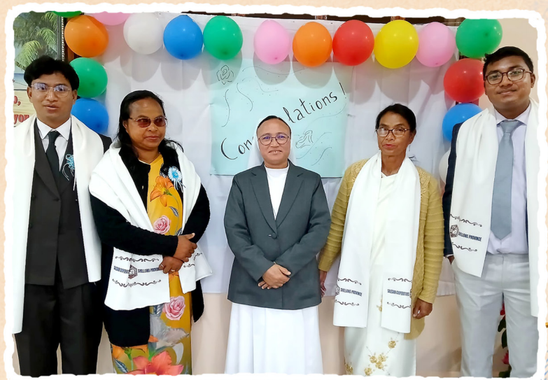
25 January 2026 Mawlai Centre