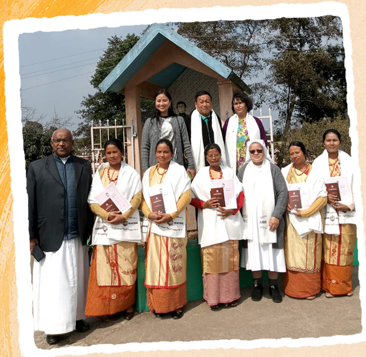
15 February 2026 Mawkyndeng Centre