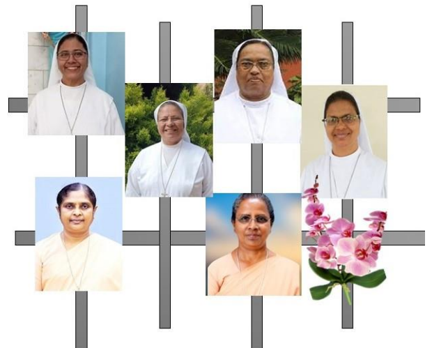
Dear FMA_PCI Provincials

Dear Sisters, Young People, Members of the Salesian Family and everyone