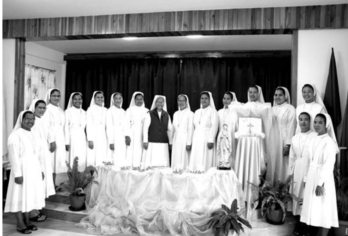
Sacred Heart Shrine, Mawlai and St. John Bosco Shrine, Sohra