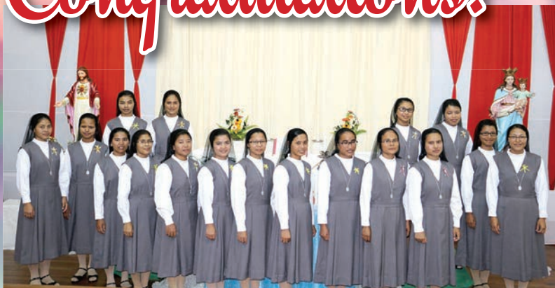
First Year Novices