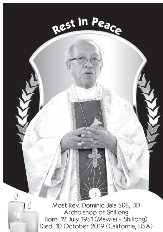
Most Rev. Dominic Jala SDB, DD Archbishop of Shillong Born: 12 July 1951 (Mawlai - Shillong) Died: 10 October 2019 (California, USA)